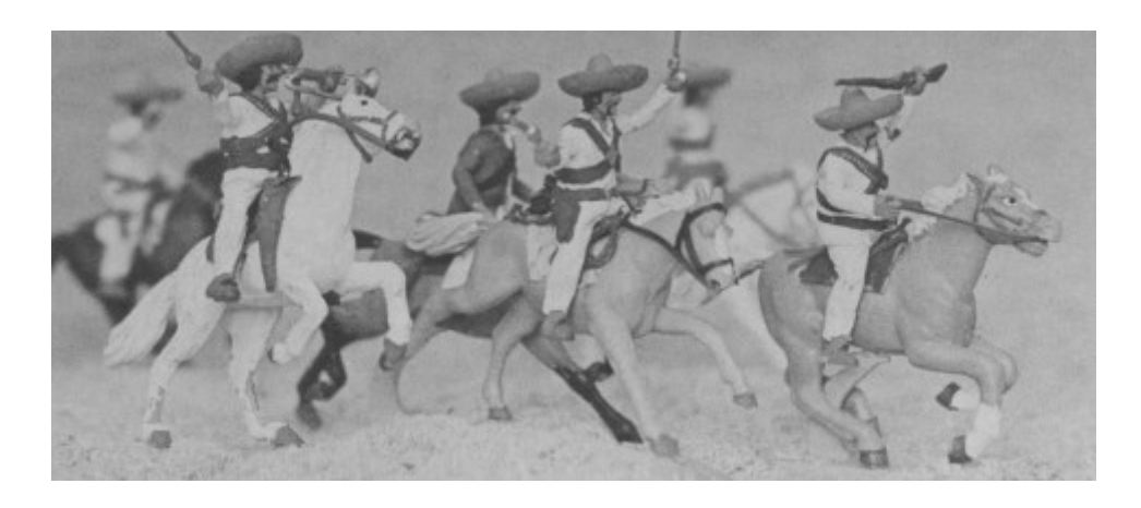
Mounted Mexican guerrillas in hot pursuit of Sergeant-Major's Legionnaires.