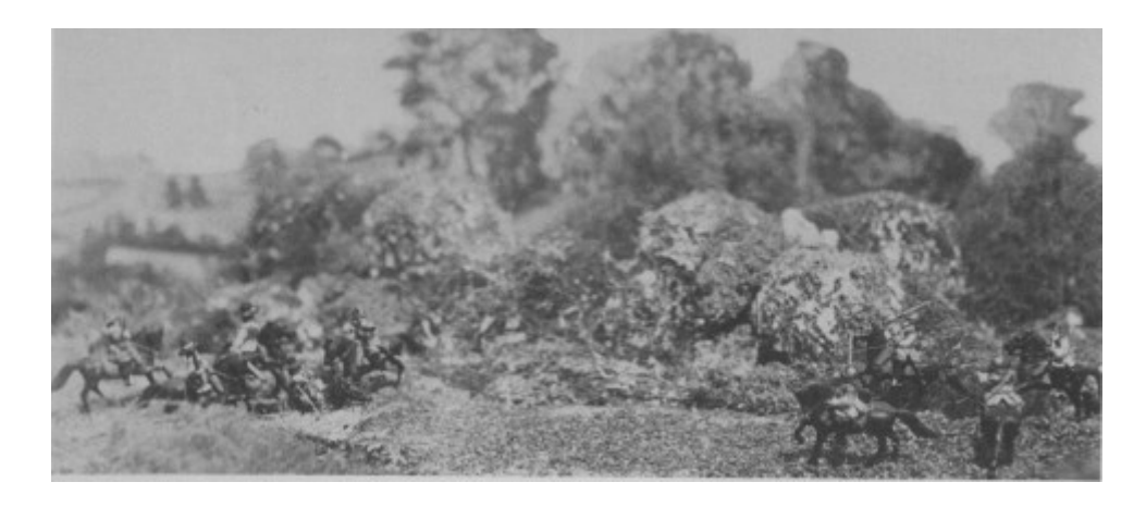
The Roundhead and Cavalier patrols meet in the land.

The first arrow that signals the noon raid on the French bombard.