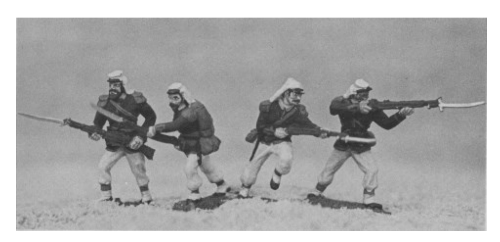
The legionnaires prepare for their final stand.