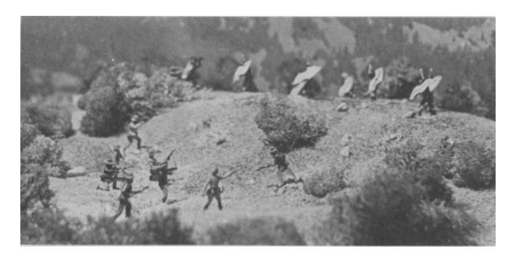
Zulus erupt over the crest of the hill hard on the heels of the English fugitives.